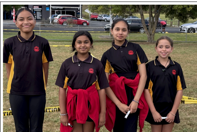
A few of our helpers!