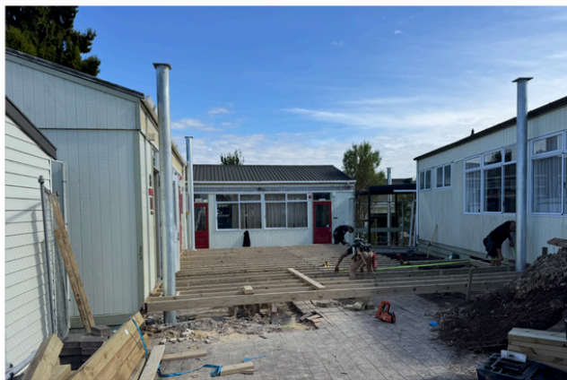
Our builders are busy at work. The 4 metal poles will be used for the cover to this space. This will be installed later in the year by Pacific Membrane.

Here are some photos from the past few weeks: