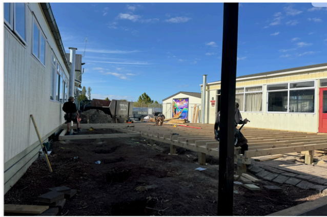
Our contractors installed the new deck between the classrooms.