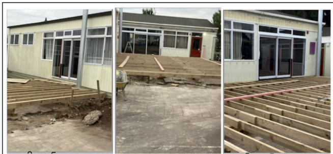
Our new sliding doors were installed in Maahoe (9), Patatee (7) and Hiinau (8).