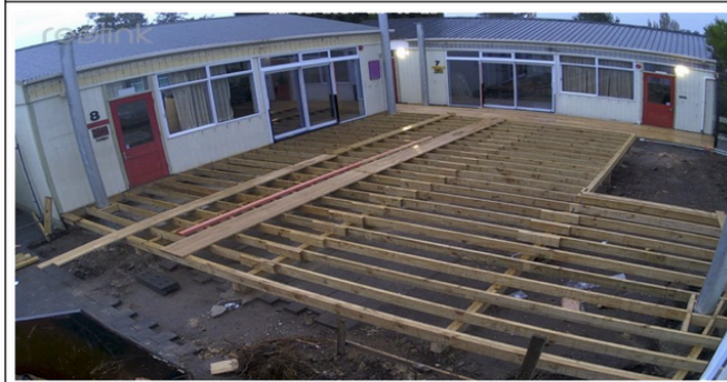
Looking towards Hiinau (8) and Patatee (7)