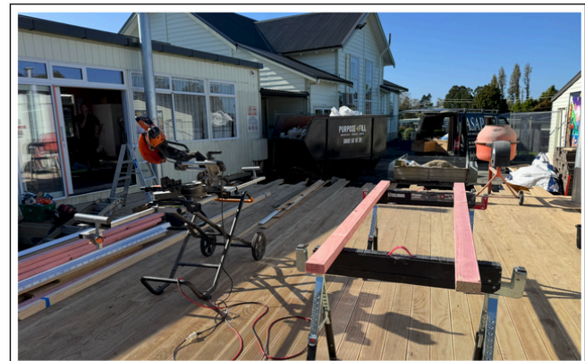
The view from Patatee (Room 7)