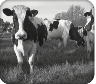
100% local vets here to help

TE KAUWHATA 91 Waerenga Rd | 07 826 4838 Located 150m past Te Kauwhata College heading east www.franklinvets.co.nz