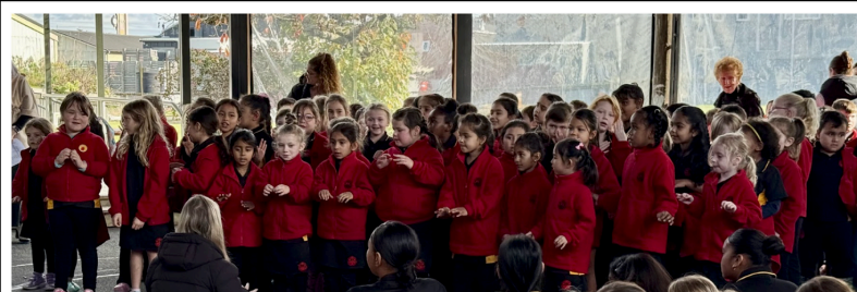
Our Year 1 - 2 Team performing for their whaanau