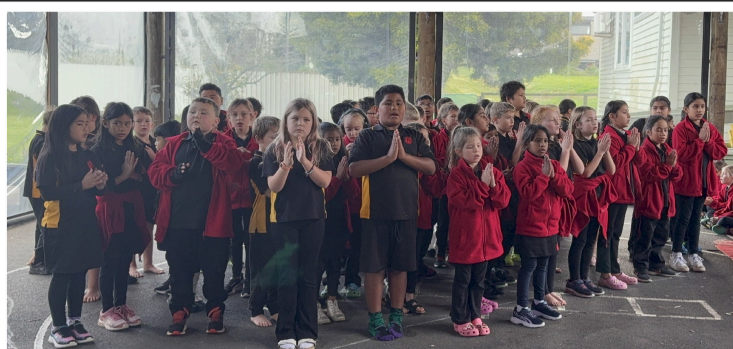
Our Year 2 - 3 students performing in the assembly area.