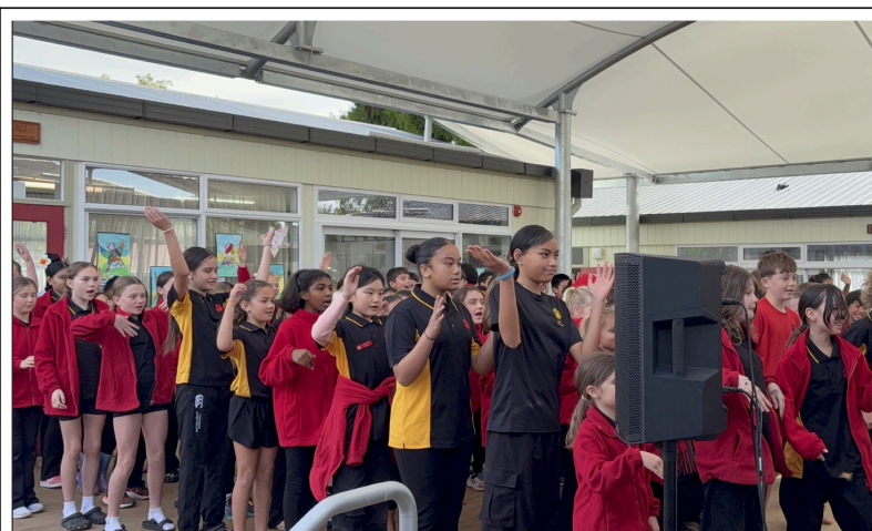
Our Year 4 - 6 Team performing in our new exterior learning space.