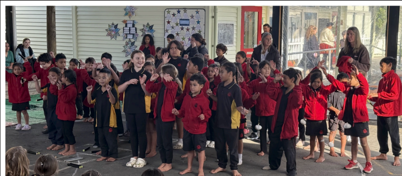
Our students from NMoNM also performed for the crowd and made us all proud!