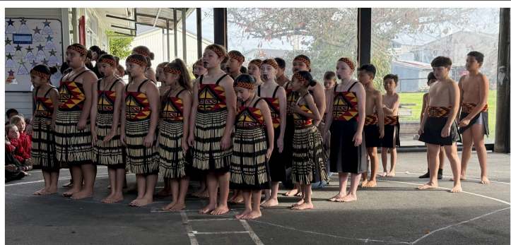
The very first performance of Te Whaanau o te kura tuatahi o Te Kauwhata, in their new Kapa Haka uniforms.